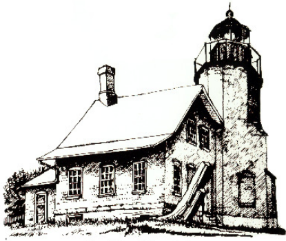
Fruitland Township White River Light Station Museum