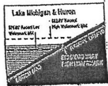
ORDINARY HIGH WATERMARK AS SET BY ACT 247 P.A. 1955 ON THE GREAT LAKES