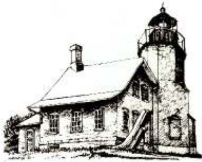
Fruitland Township White River Light Station Museum